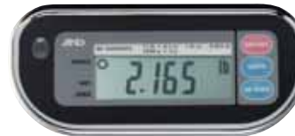
Lb mode, SK-WP models