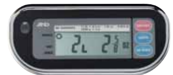
Lb/fractional oz mode, SK-WPZ models