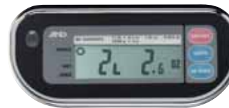
Lb/decimal oz mode, SK-WPZ models