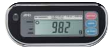
Metric mode, SK-WP models